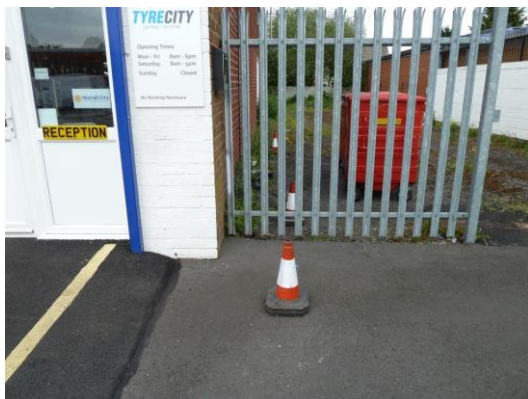
Likely leak position just in front of the metal fence (no surface noise to confirm correlation however)

Audible leak noise could be heard on the rising main and at the water meter. Leak noise correlation was carried out which gave a clear leak position just in front of the high metal fence outside the front entrance to the premises. Although the whole area was acoustically sounded for any surface noise to confirm the correlation, none could be found. This may be due in part to the high amount of ambient noise being created by the constantly busy road running past the premises. The ground microphone was also used in this area but no noise could be identified.