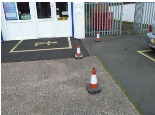
Line of main curving round building