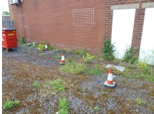
Traced line of pipework alongside building