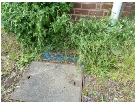
South Staffs area for investigation - IGNORE! Leak noise heard on building wall at this point believed to be originating from rising main