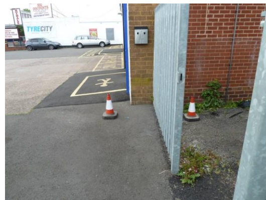
Excavate behind fence first (cone on RIGHT) to check leak isn't here before breaking into new tarmac in front of fence (cone on LEFT)