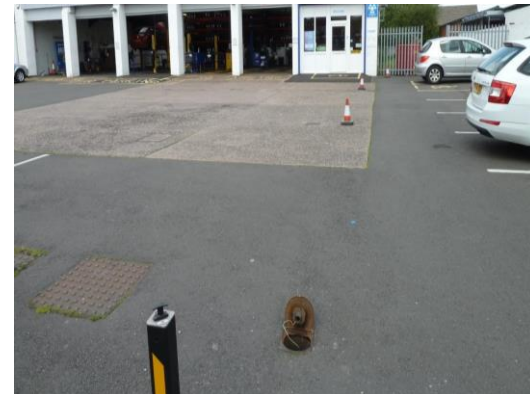
External line of pipework up to building (cones)