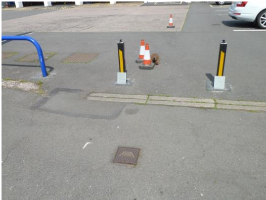
Stoptap and meter locations in forecourt

The rising main is copper pipework, which rises in the corner of the staff toilet. The pipework was traced out from the meter (clipped on to the brass body of the meter) the route of which can be seen on the attached site sketch. From the rising main, 15mm copper pipe is surface clipped around the building to supply all points of water use.